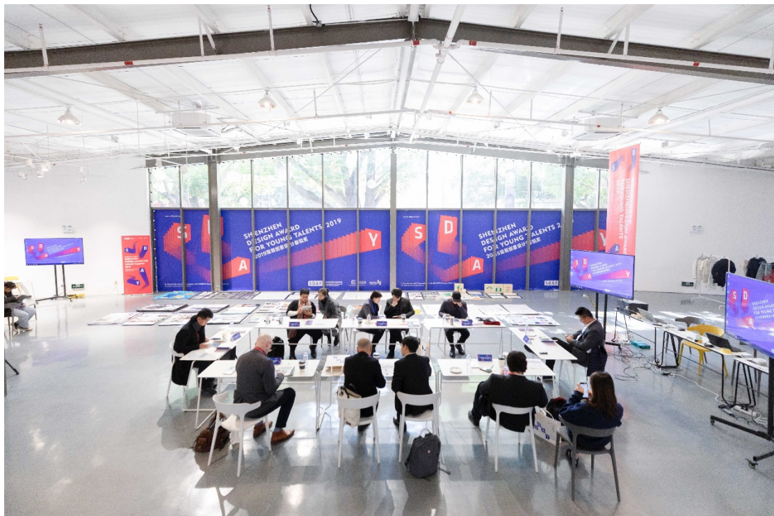
The jury panel reviewed entries online.