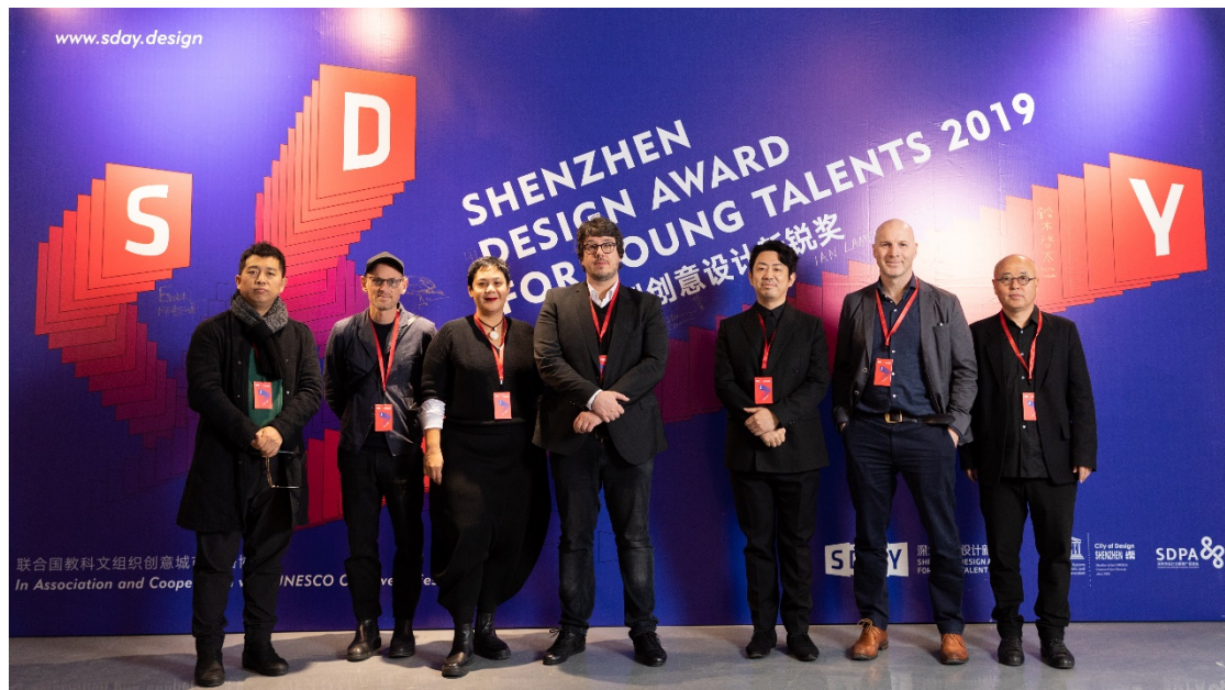
Group photo of the Jury panel.